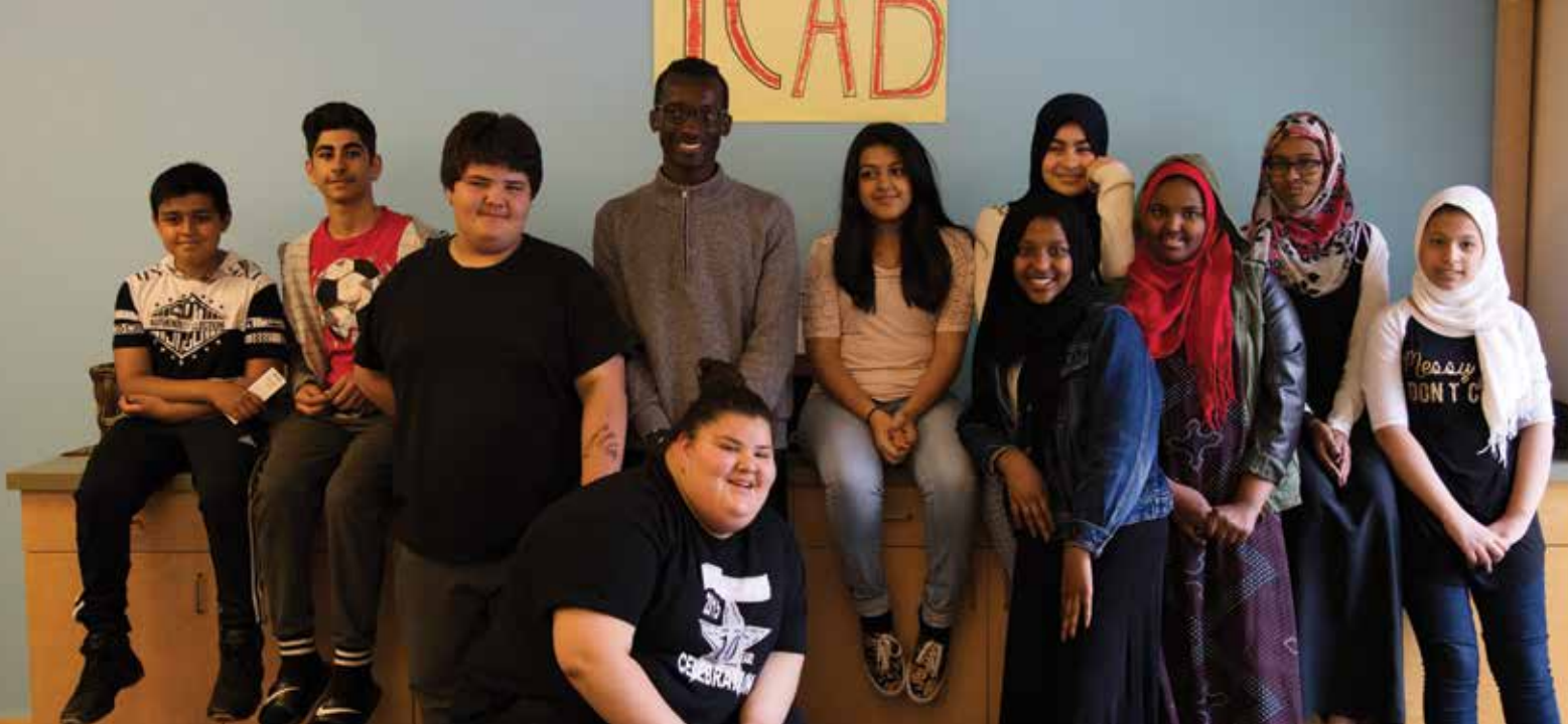
Members of New Columbia's Youth Community Advisory Board, or YCAB, pose for a group photo in the safe space the community has dedicated to their efforts.