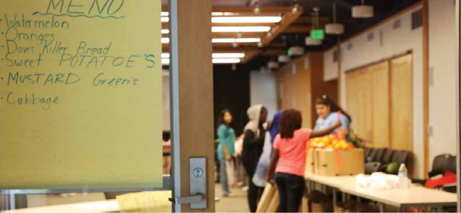
Teens from the New Columbia mixed-income neighborhoods set up tables of fresh food to be handed out at a monthly food distribution event. They aim to reach their peers who may be struggling with food insecurity.

Our continued partnership with Feeding America, as well as new funding from the ConAgra Foods Foundation and the Doris Duke Charitable Foundation, allowed us to expand our research in 2015 to seven more communities with strong service provider partnerships and capacity for organizing focus groups on teen food insecurity. The final mix of 10 communities reflected a substantial degree of diversity in terms of the communities themselves and the types of youth who shared their perspectives (see the Methodology section for an in-depth description).