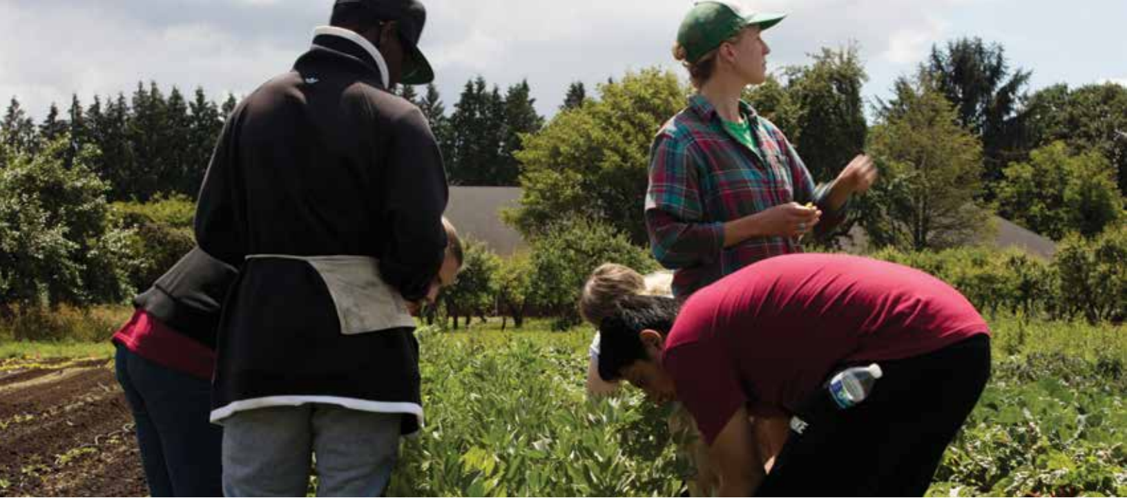
A group of teenagers harvest vegetables at a farm on Sauvie Island, just miles outside Portland, Oregon. Through their employment with Food Works, teens are able to help contribute to their families' collective incomes, gain job experience and leadership skills, and bring food home.

Teens talk about their perceptions of their financial responsibilities in different ways. Most young people said teens often work to provide for their own needs, including basic food, clothes, and school supplies. In food-insecure households, their earnings free up resources for their families to spend on other essentials. Teens earn money, a Washington, DC, boy said, "...so they [parents] don't have to buy you nothing. You can buy your own stuff and...money they had they could spend on you, they can use for...the needs in the house, and they'd have more money for [them]." Regardless of the level of necessity, however, earning money also helps young people experiencing economic hardship acquire the things that make them feel "normal"—shoes, clothes, computers, and school activities.